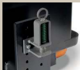
Spring-Loaded Pin and Clevis

Hitches are available in five styles to accommodate the variety of couplers used on towable carts. All hitches are built from premium grade steel for