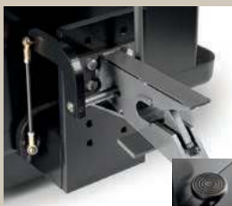
Automatic with Quick Release